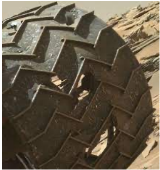
Curiosity's wheel damage