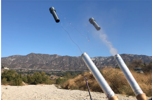
Figure 2 – Deployment of TH2OR antenna loop via projectiles launched by a compressed cold-gas launcher at the Arroyo Seco in Pasadena, CA.

Sounding with the prototype electronics detected the water table of the unconfined aquifer beneath, and the overall resistivity structure of the Arroyo is a scaled-down version of the Mars subsurface (Fig. 3) during the testing season, as it consisted of a 40-to-50-meter resistive dry layer over a conductive saturated aquifer. The depth to water table was verified via other geophysical methods and well data.