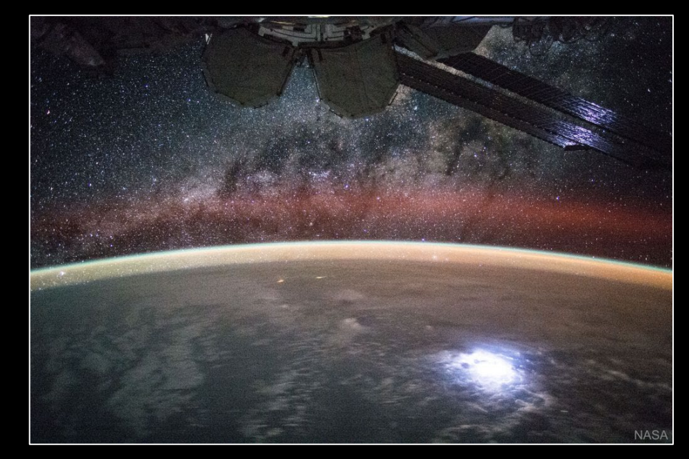
This image taken from the International Space Station shows swaths of airglow hovering in Earth's atmosphere. NASA's new Atmospheric Waves Experiment will observe airglow from a perch on the space station.