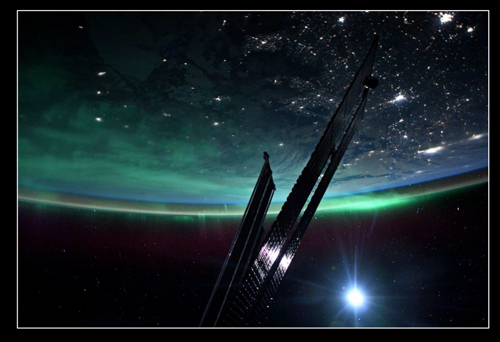
This photo was taken from the ISS on Feb. 28<sup>th</sup> and shows the sweeping scale of the aurora during a geomagnetic storm

Vigil AO will be released soon with updates based on feedback from Draft AO