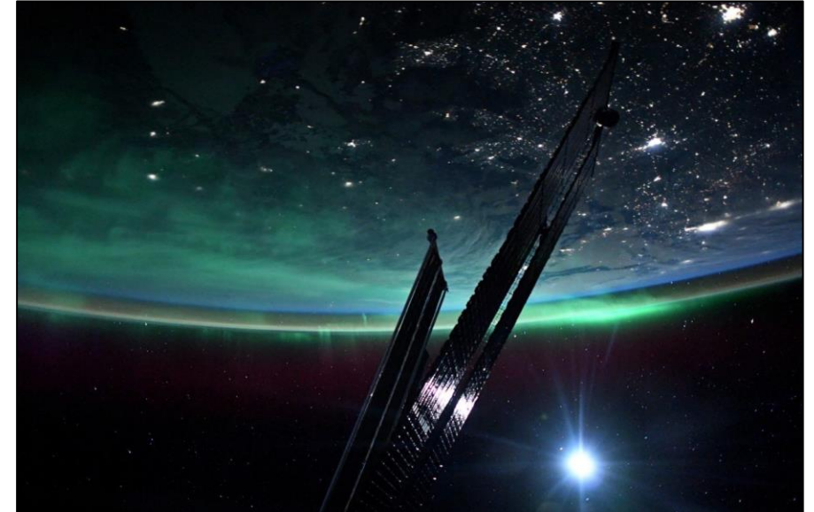
This photo was taken from the ISS on Feb. 28 th and shows the sweeping scale of the aurora during a geomagnetic storm