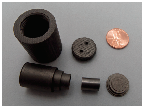
The fuel pellet in an RHU, inside the small metallic cylinder at bottom center in this image, is about the size of a pencil eraser.

An RHU is very compact, standing only 1.3 inches (3.2 centimeters) tall by one inch (2.6 centimeters) in diameter, with a total mass of about 1.4 ounces (40 grams). As of September 2014, the average thermal power of the RHUs in the DOE's inventory was approximately 0.90 watts each; this thermal power will continue to decrease by about one-hundredth of a watt per year, due to the natural decay of the radioisotope fuel (Pu-238 has a half-life of 88 years).