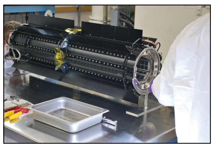
Next Gen RTG Mod-0 Inspection.

To support expected mission needs, the Next Gen RTG project will deliver three variants of RTGs. The first variant, known as Mod 0 ("mod zero"), is an in-depth refurbishment of a single legacy GPHS-RTG unit. This effort leverages "off-the-shelf" hardware to provide a flight unit ready for mission use prior to the delivery of new Next Gen RTG flight hardware (Mod 1). The Mod 0 unit will provide GPHS-RTG-like power—estimated at 290 Watts electric—based on the use of 18 legacy GPHS modules dependent on mission conditions