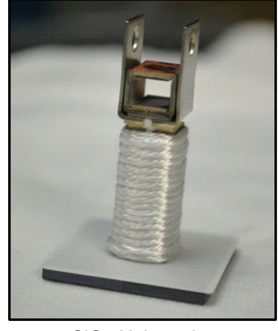
SiGe Unicouple.

The Next Gen RTG will employ heritage Silicon Germanium (SiGe) unicouples using a design that was successfully utilized in the Multi-Hundred Watt-RTG (MHW-RTG) that has operated for more than 45 years aboard Voyager 1 and 2, as well as the GPHS-RTGs flown by Galileo, Ulysses, Cassini, and New Horizons.