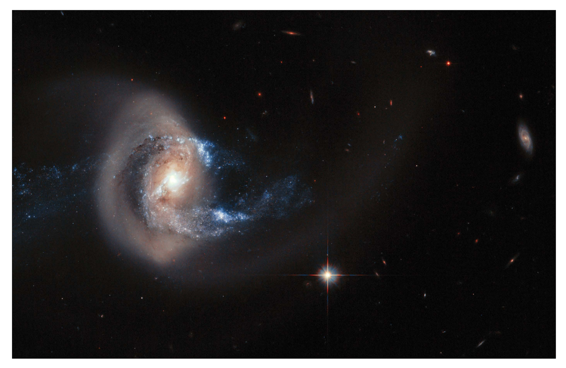
Interacting Galaxy NGC 7714