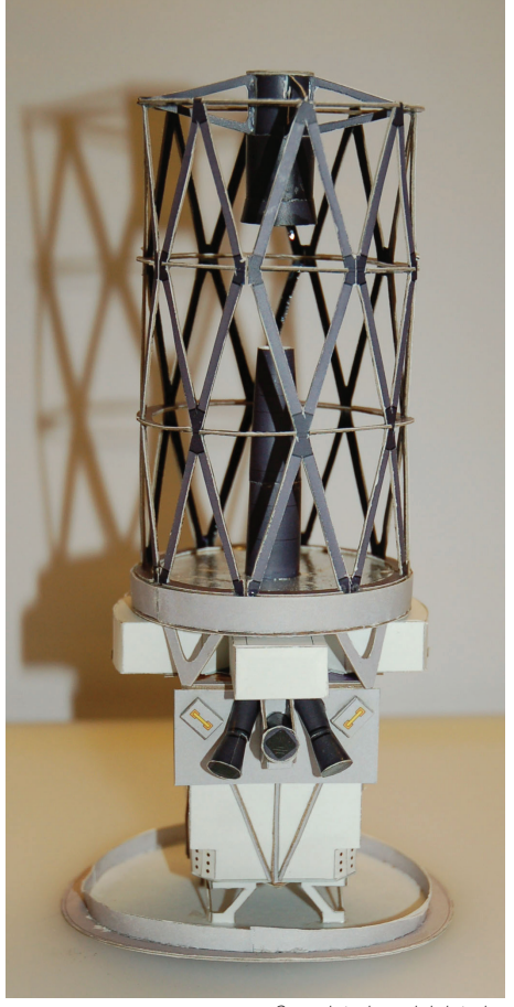
Completed model, interiorr

This project is not appropriate for young children because of the high level of detail and the use of dangerously sharp tools. The estimated completion time is 30 hours.