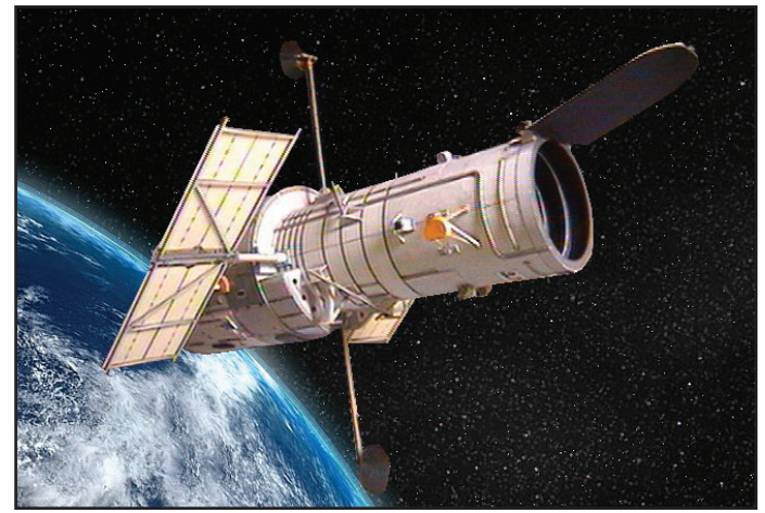
Completed model, exterior (display suggestion)

Complete assembly directions and more information can be found online at www.hubblesite.org/go/model