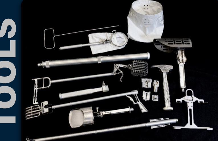
NASA Design Reference Geology Tools